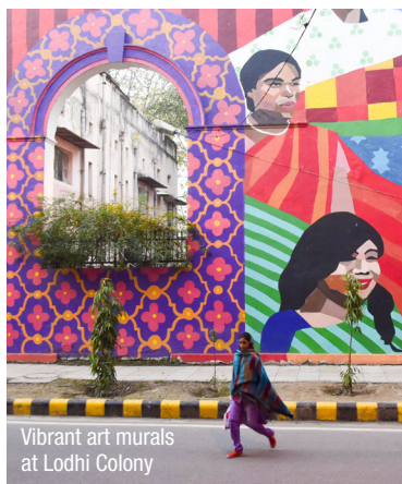
Vibrant art murals at Lodhi Colony

Out-of-town getaway: Agra is around three hours away via the Yamuna Expressway. At sunrise, the first rays give the Taj Mahal a surreal, pale pink hue. Combining architectural beauty with a nostalgic love story, this 17th-century marble monument is truly stunning.