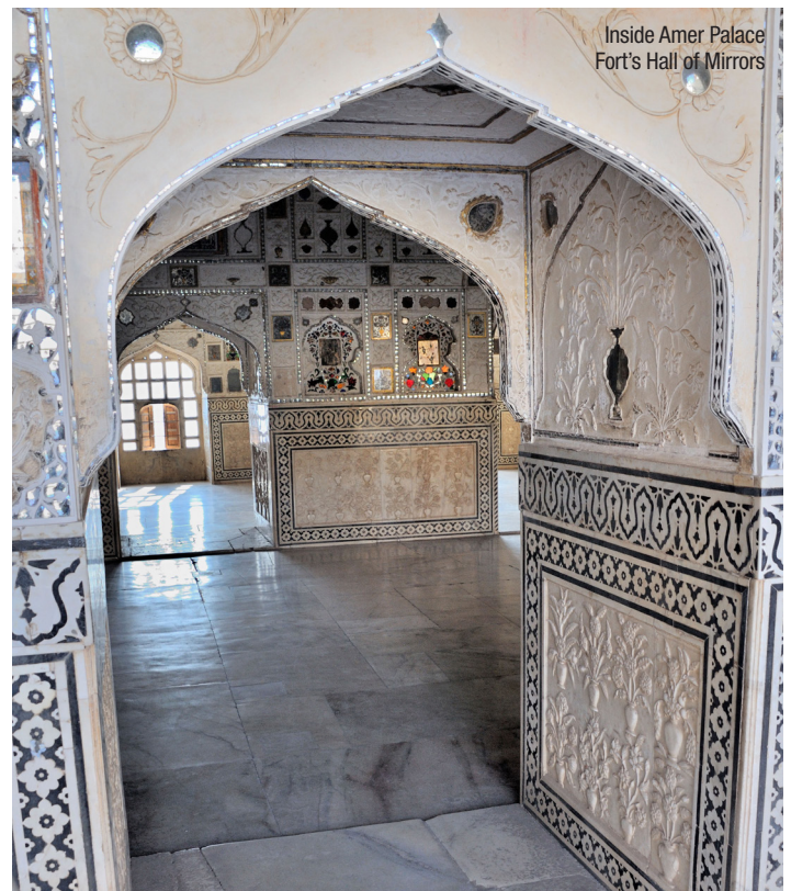
Inside Amer Palace Fort's Hall of Mirrors

Out-of-town getaway: Thanks to the new Delhi-Jaipur highway, I like to get behind the wheel for a three-hour drive to Jaipur in Rajasthan. The majestic 16th-century Amer Palace Fort (also known as Amber Fort) perched on a hill is always an awe-inspiring sight. I love the dazzling Sheesh Mahal (Hall of Mirrors) in the fort, where small mirrors in intricate patterns bedeck the walls. I also enjoy browsing Jaipur's lively markets for colorful, traditional Indian wear.