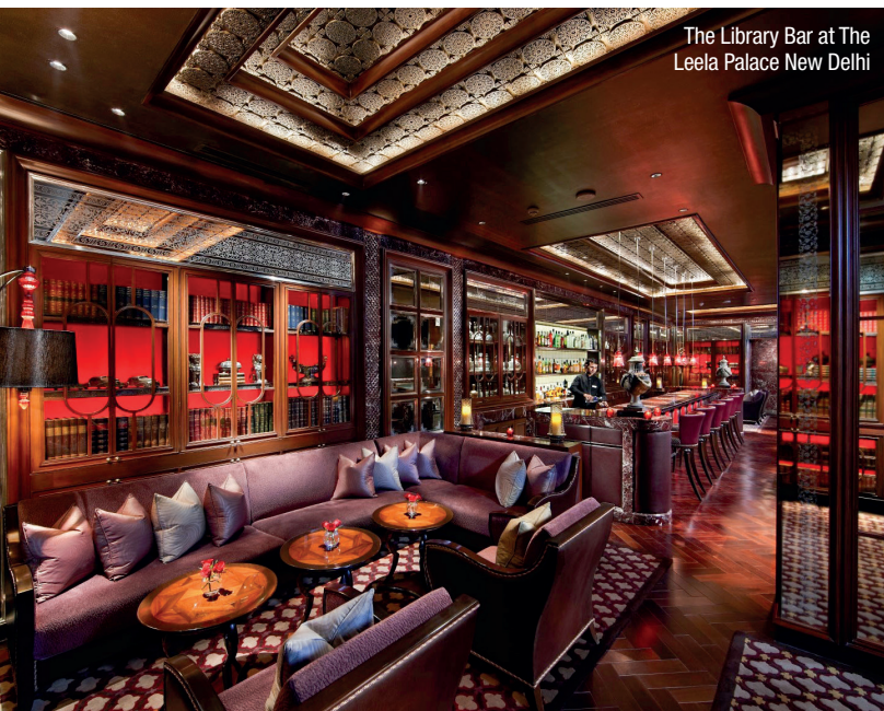
The Library Bar at The Leela Palace New Delhi