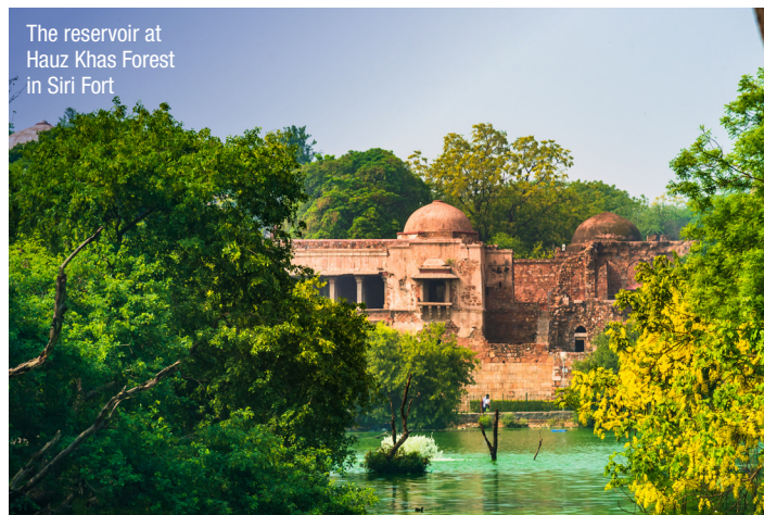
The reservoir at Hauz Khas Forest in Siri Fort