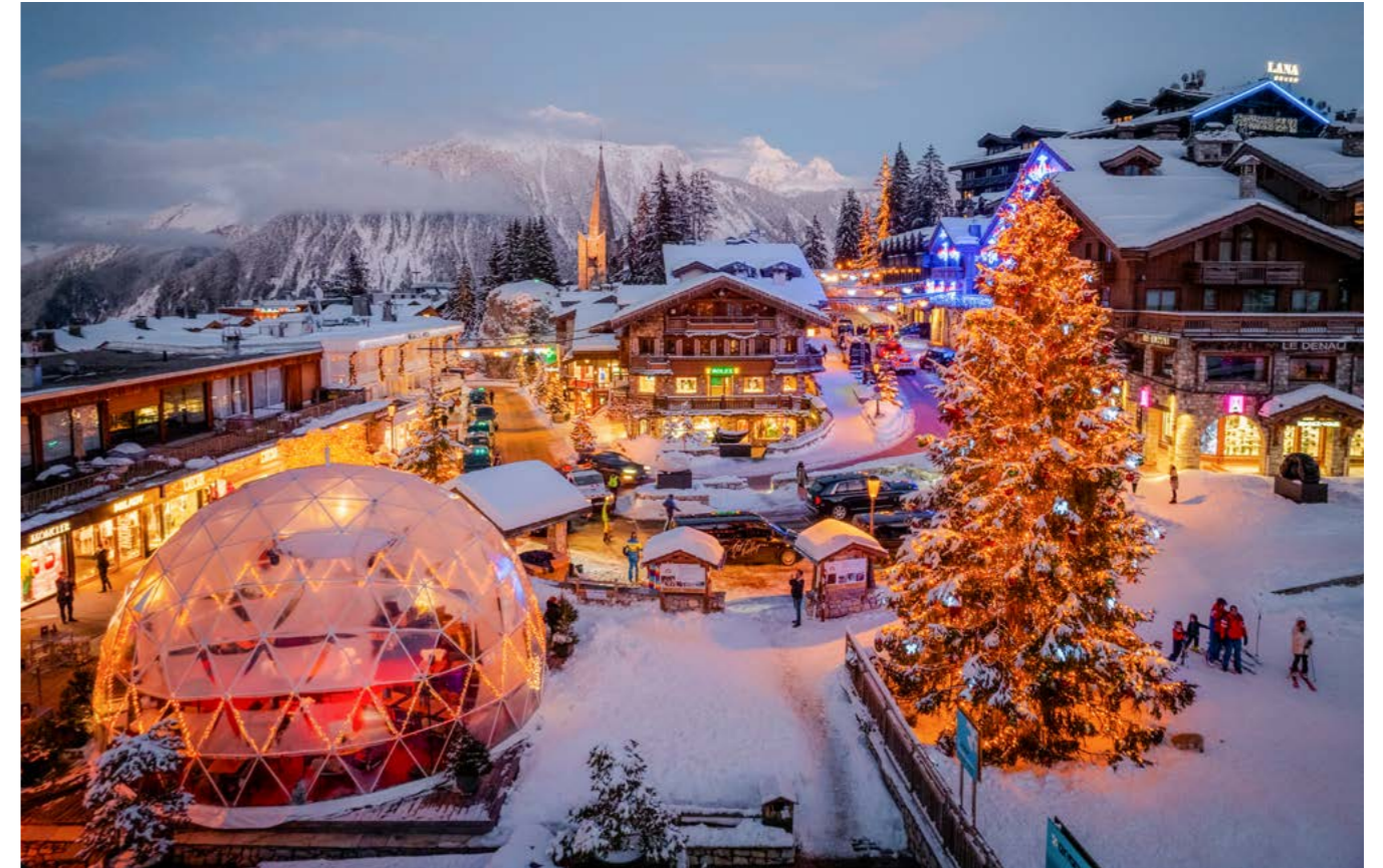
Clockwise from left: Courchevel 1850 is part of Les 3 Vallées, the largest expanse of ski slopes in the world; It is a destination where Christmas dreams truly come to life; In the heart of the town, skiers can take one of 50 lifts to access 102 pistes, from beginner-friendly to expert-level runs.

I walk where skiers donned in chic designer ski suits and jackets are going up the slopes in Gucci-branded gondola lifts. I wear my ski suit and get onto a gondola to a bunny slope called Magic Carpet, where beginners learn. I am skiing for the first time and inevitably keep falling. But I keep trying till I can manage to go a few metres.